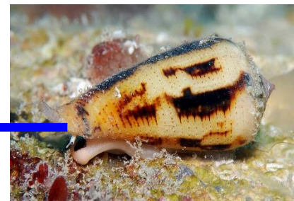
Derived from Cone snail: Conus magus

ziconotide ( Prialt® ) FDA approved ( 2004 ) disease target: severe pain Developed by: Elan pharmaceuticals