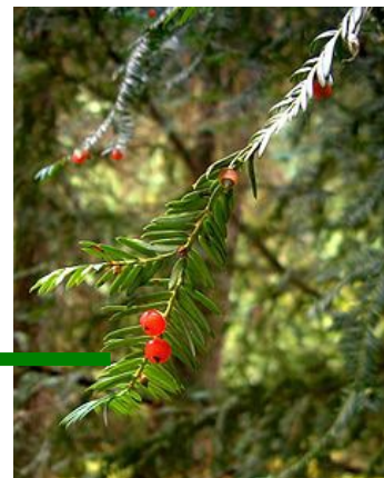
Taxus brevifolia Pacific Yew tree