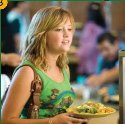
12:36 p.m. Grabbing lunch after our monthly student government meeting.