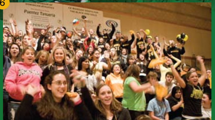
8:46 p.m. Going crazy when the women's volleyball team gets a big win after sweeping a rival in three straight sets.