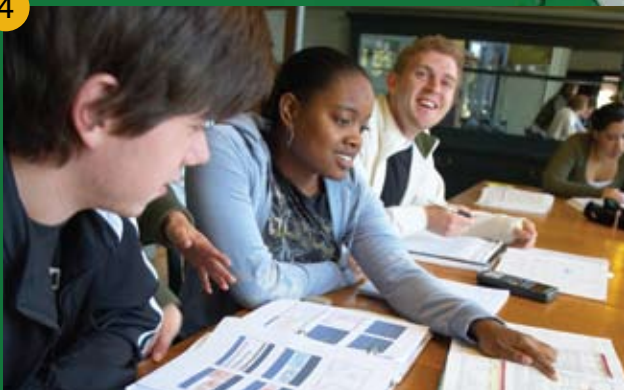
2:11 p.m. Debating the pros and cons of a free market economy in a global marketplace during a small group discussion.