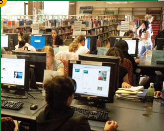
4:47 p.m. With some time between classes and dinner, it's off to the library to do some research for class before getting together at the Student Union to watch The Office .