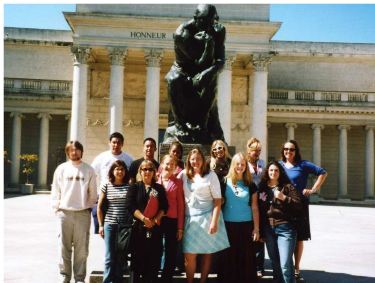
Field trip to the California Palace of the Legion of Honor Art Museum in San Francisco

Among the new offerings of the revised Honor Program at Dominican University is the First Year Foundation course "The Scholar: Biography and Portraiture."