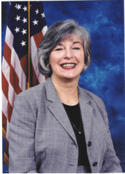
U.S. Congresswoman Lynn Woolsey

Hosted by Marin Women's Commission & Dominican University of California's Institute for Leadership Studies