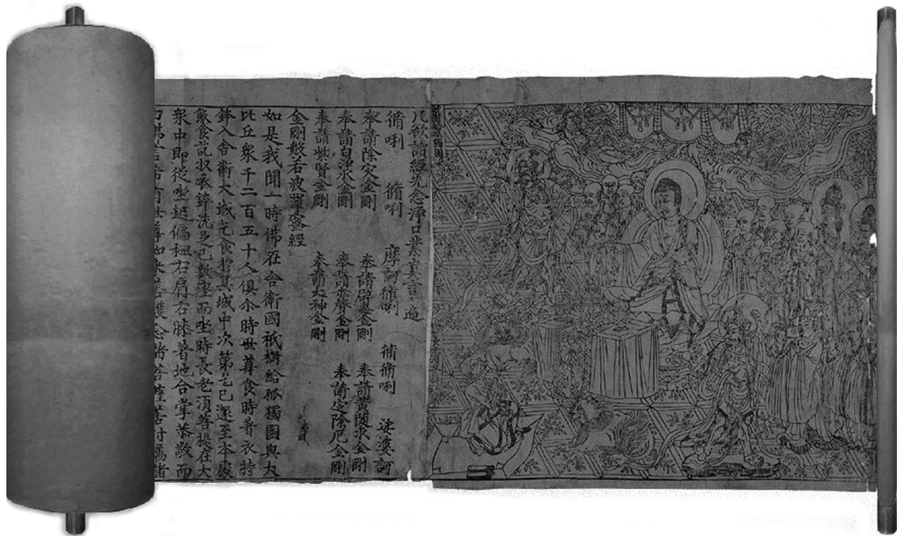
A section of the Diamond Sutra scroll (c. 868 CE), the oldest known printed and dated book in the world, was discovered in China's Dunhuang caves in the early twentieth century.

a constellation of new characteristics. These societies are technically called civilizations, or agrarian civilizations to emphasize their dependence on their surrounding agriculture. This happened all over the world, largely independently. Early agrarian civilizations include Sumer (about 3200 BCE), Egypt (about 3100 BCE), the Indus Valley (about 2300 BCE), northern China about 1700 BCE, the Classic Maya (250–800 CE), the Aztecs (late fifteenth century to early sixteenth century CE), and the Inca in the Andes (early sixteenth century CE).