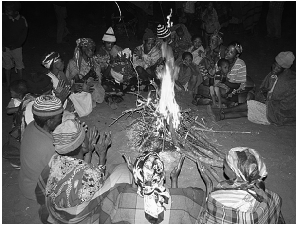
Members of a Bushmen tribe keep alive the ancient tradition of handing down history through stories and song.

to sixty, young humans learned from their parents, extended family, and kin. As human societies expanded into tribes and chiefdoms, the young, as they reached puberty, must have experienced more structured social experiences, such as rituals and initiations.