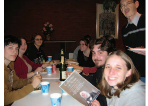
Students enjoying the monthly “Community Dinner” where students cooked a complete meal on Sunday evenings prior to the Sunday evening Mass.