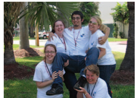
Dominican students once again participated in the “Dominican Preaching Conference,” held at Barry University in Miami. The Conference brings together representatives from the 17 Dominican colleges and universities in the U.S. for a week of learning and study about the Dominican charisms and how students can put them into effect in their lives.