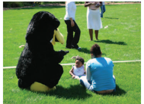
Chilly, the school mascot, helps during the annual Easter Egg Hunt for children from Homeward Bound. The event has become a cherished highlight for both students and the children.