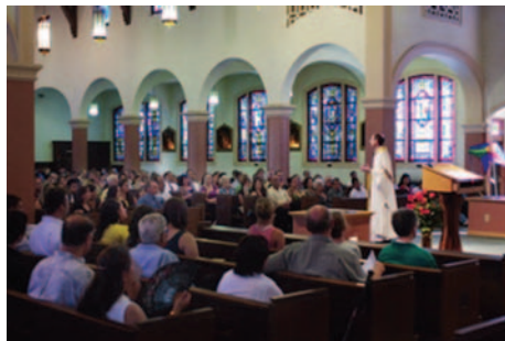
Baccalaureate Mass, held at St. Raphael’s Church in San Rafael, began this year’s Commencement Ceremonies. Seniors joined with their classmates, families, and friends to begin the weekend of celebration with the traditional Mass.